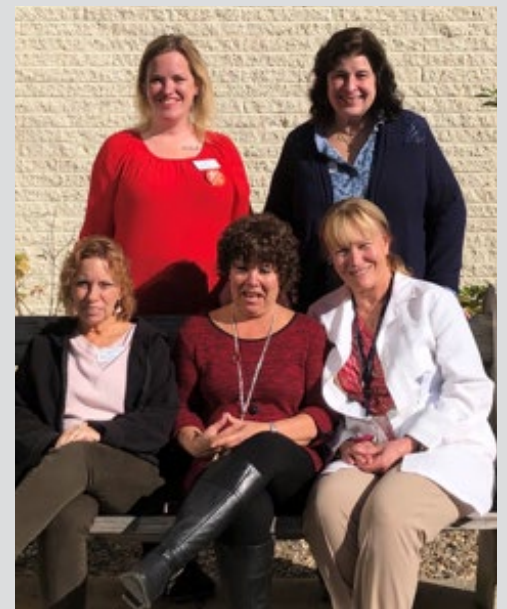
Nursing Program Alumnae and Now Full-Time Nursing Faculty Members Pose for a Photo

DID YOU KNOW? -- Five of Atlantic Cape's eight full-time Nursing faculty members are graduates of the college's Associate in Applied Science Nursing program! They have all gone on to complete graduate degree programs. Additionally, two Nursing and Health Sciences Department staff members and six part-time faculty members have earned degrees at Atlantic Cape.