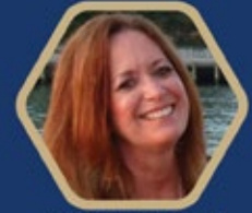
In Memoriam Tribute

Author & President of the Ocean City Free Public Library Board of Trustees